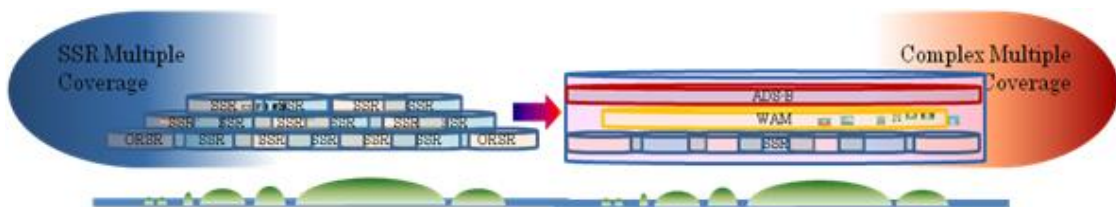
Figure 1; Image of introduction of multi radar

Multi radar system enables to improve target tracking for refresh rate and accuracy by fusion process of surveillance data. And it will start the operation in 2018.